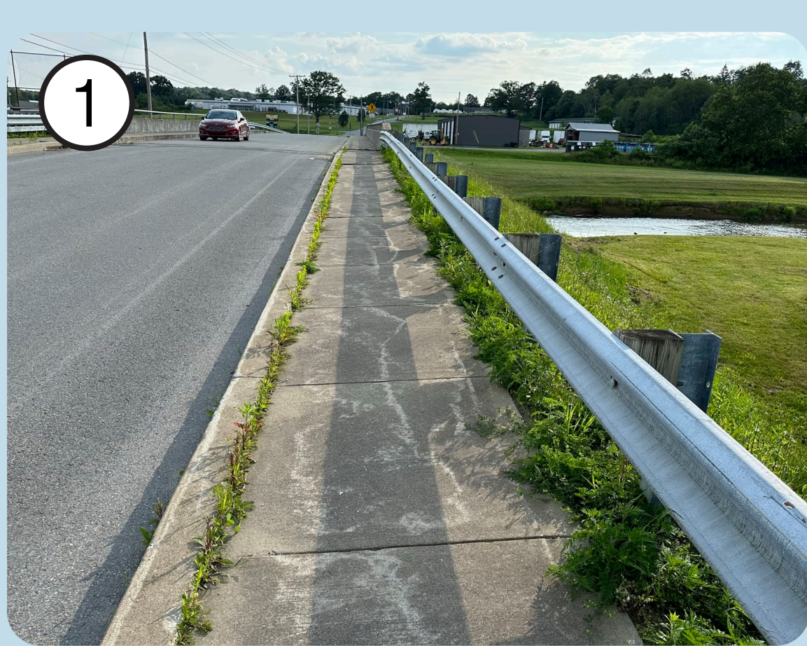
EXISTING SIDEWALK AT BRIDGE