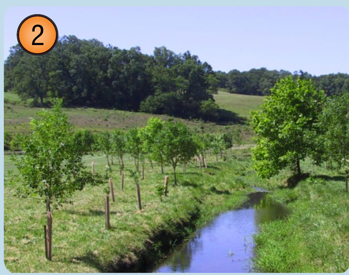
RIPARIAN BUFFER PLANTINGS