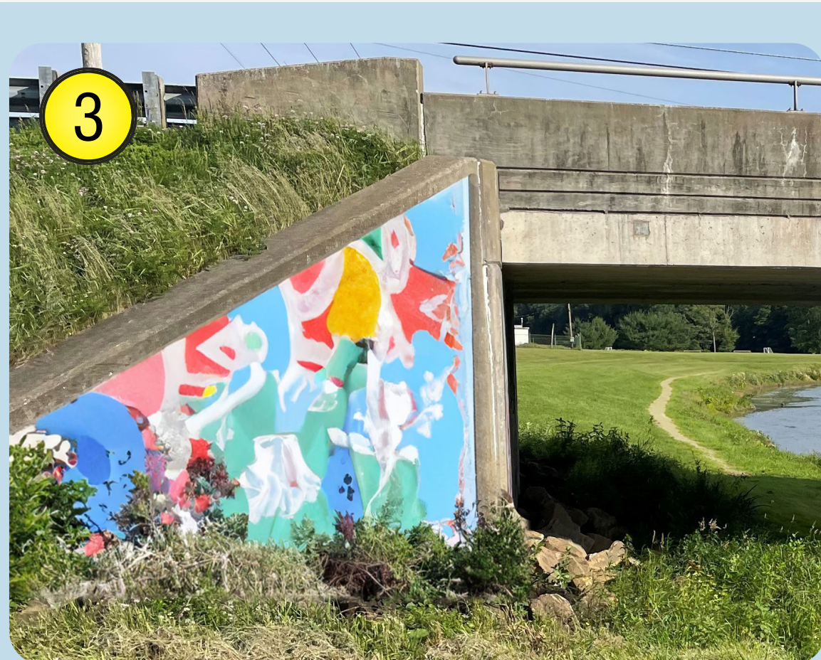
COMMUNITY MURAL PROJECT