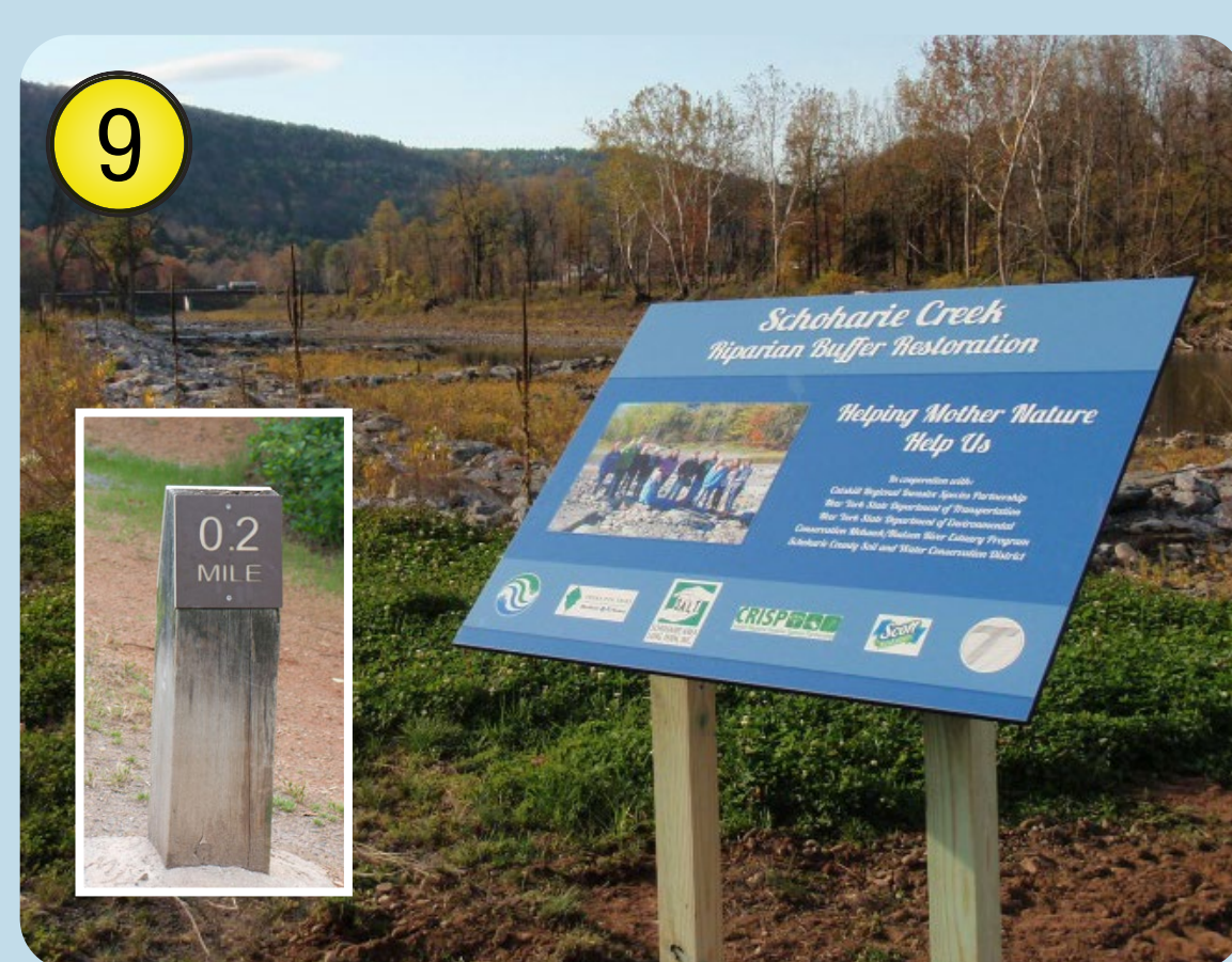
TRAIL SIGNAGE & MILE MARKERS