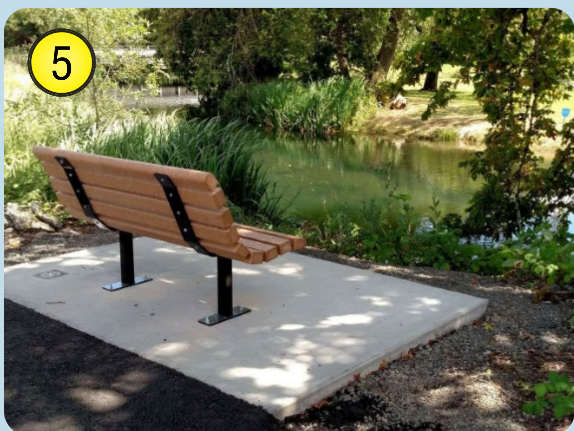
BENCHES ALONG TRAIL