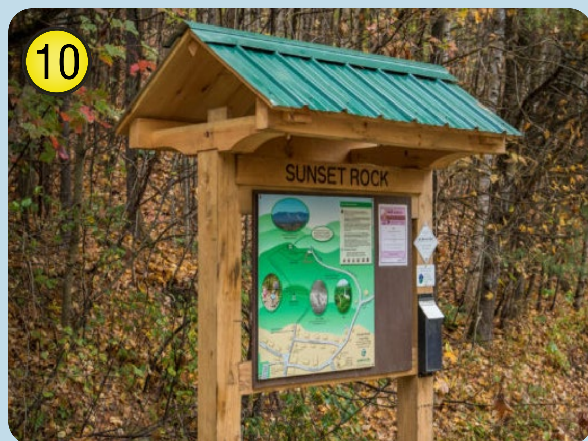
INFORMATION KIOSK AT TRAILHEAD