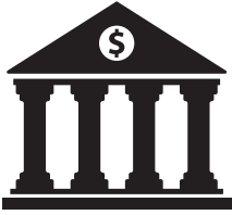
Exhibit A: Sample Contributor Letter

Happy Valley Bank 1234 Main Street Downtown, PA 00000